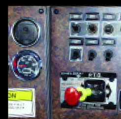
Air Shift PTO

SEE PAGES 7-10 FOR COMPARISON CHARTS OF STANDARD FEATURES AND EQUIPMENT OPTIONS