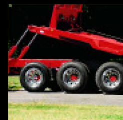
Standard Tri-Axle Subframe for Transporter 28' Decks