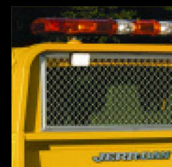
A Variety of Light Bar Packages (Stop-Turn and Work Light)