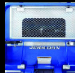
Upper and Lower Work Lights Next to Winch