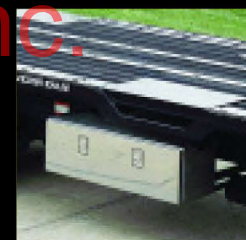
S/S Door Tool Boxes 36", 48", 60"