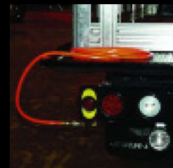
Rear Air Hookup at Tail Light (Hose Not Included)