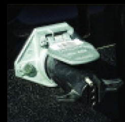
7-Way Plug with Adapter / 7-Round to 4-Flat and 7-Round to 6-Round (Standard with 10 and 15 Ton Tow Options)