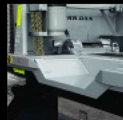
8' Wheel Wells with Optional Covers