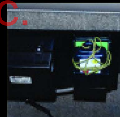
Wireless Remote for Optional Winch/Buzz Box Holder (Buzzer Goes Off When Out of Holder)