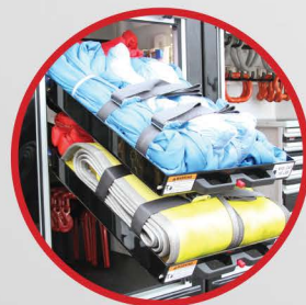
TILT DOWN TRAYS