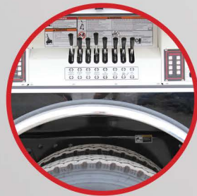
ROTATOR-STYLE CONTROL STATIONS