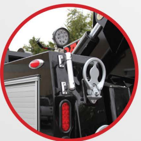
LED WORK LIGHTING

LOAD RATED HANDLES / STEPS W/ ANTI-SLIP TEXTURING