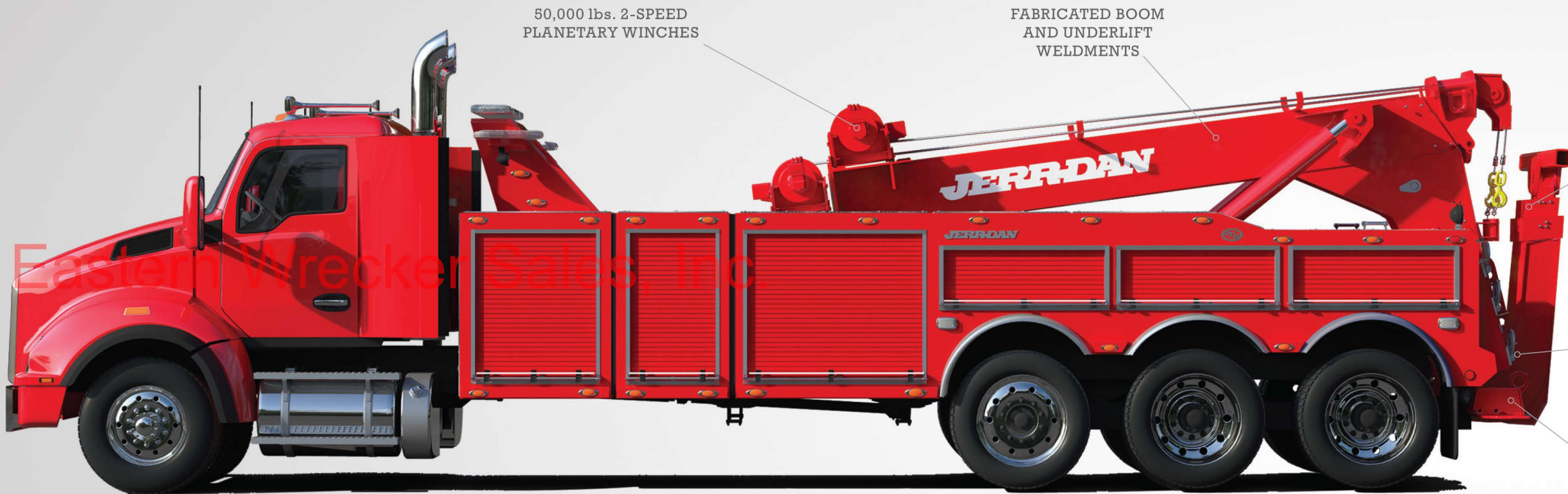
50,000 lbs. 2-SPEED PLANETARY WINCHES