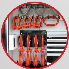
RECOVERY RIGGING STORAGE