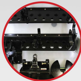
LIFT ATTACHMENT STORAGE (18 SETS OF FORKS)