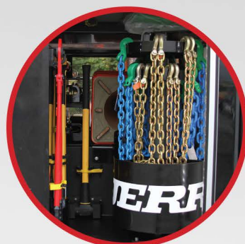
CHAIN CAROUSEL OIL DRY SILO