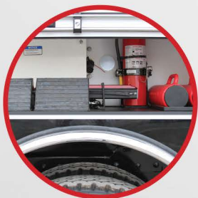
POWER DISTRIBUTION CENTER