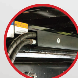
HYDRAULIC STEEL LINES WITH PROTECTIVE COVER