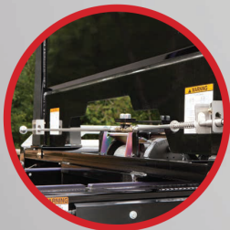
DUAL MANUAL FREE-SPOOL (OPTION)