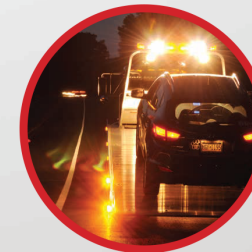
RAIL LIGHTING (OPTION)