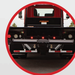
LED DOT LIGHTING