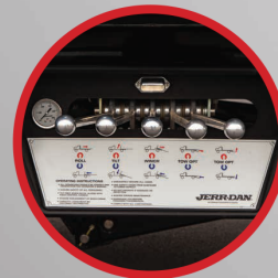
DUAL LIGHTED CONTROL STATIONS