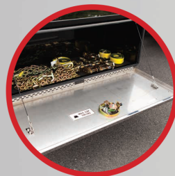
STANDARD TIE-DOWN KIT