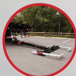
3.5K UNDERLIFT WITH GALVANIZED L-ARMS