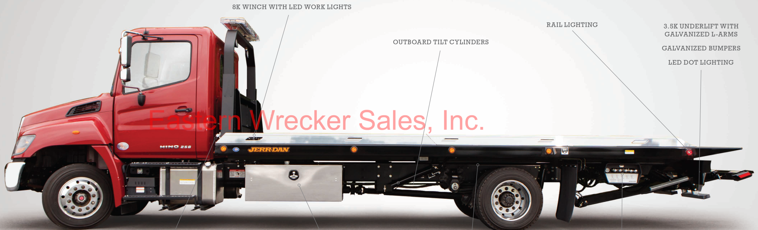
8K WINCH WITH LED WORK LIGHTS

At 7.5 degrees, the 6 Ton XLP offers the lowest load angle in its class, guaranteeing clearance on even the lowest profile vehicles. It's also the lowest maintenance carrier in the world, thanks to Jerr-Dan's Innovative No-Lube™ technology.