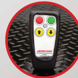
REMOTE CONTROL (OPTION)