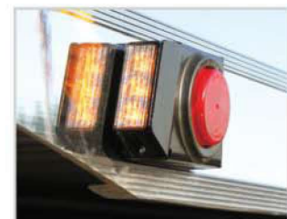
Side-mounting helps to minimize potential blockage from payloads

Eastern Wrecker Sales, Inc www.easternwrecker.com - 919-553-4038