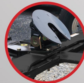
FIFTH WHEEL ATTACHMENT (OPTION)