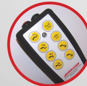
WIRELESS REMOTE CONTROL (OPTION)