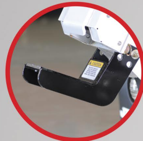
BALL HITCH ATTACHMENT