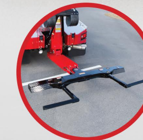
HYDRAULIC SELF- LOADER (OPTION)