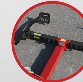
PIVOTING MANUAL L-ARM (OPTION)