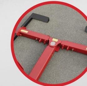
MANUAL L-ARM (OPTION)