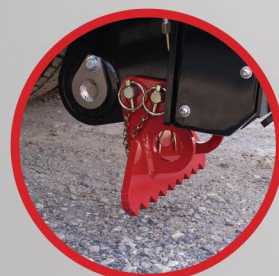
SPADE FOOT ATTACHMENT (OPTION)