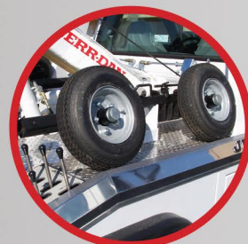
TOW DOLLY WITH STORAGE BRACKET (OPTION)