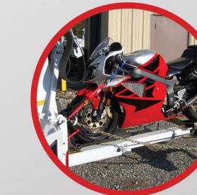
MOTORCYCLE ATTACHMENT (OPTION)