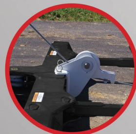
RECOVERY SHEAVE (OPTION)