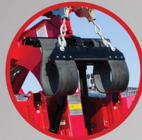
TOW SLING (OPTION)

A corrosion-resistant modular aluminum body is built for a long working life, and Jerr-Dan's exclusive No-Lube™ technology reduces maintenance, saving time and money.