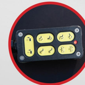
MEMBRANE REMOTE CONTROL