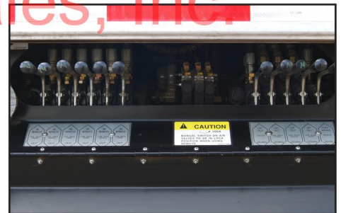
Manual Hydraulic Controls