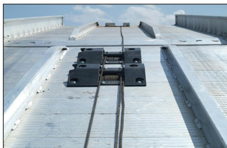
One Winch per Vehicle Upper and Lower Deck