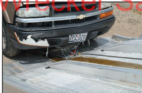
Rugged Guide Rails on Lower and Upper Decks