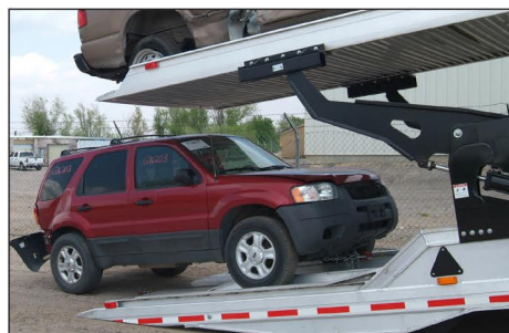
Adequate Clearance on Wide Variety of Vehicles