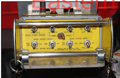
Cordless Hydraulic Controls