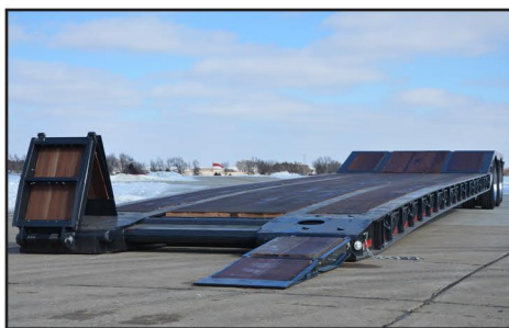
Standard Easy Fold Ramps in Load Position