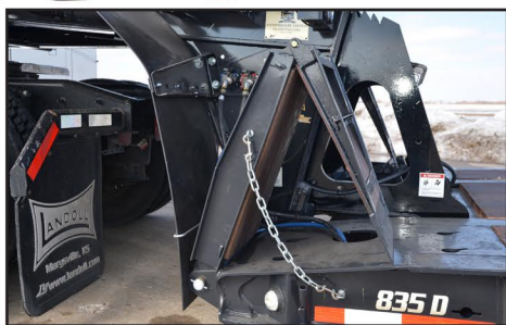
Standard Front Ramps in Transport Position