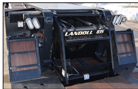
Optional Lights Shown