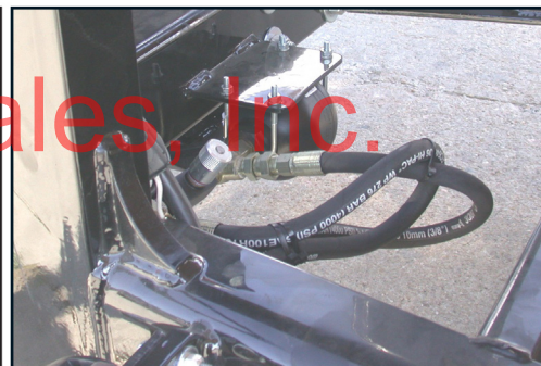
Accumulator and Valve