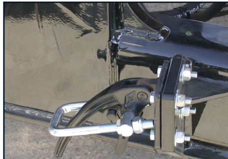
Deck Lock Latch