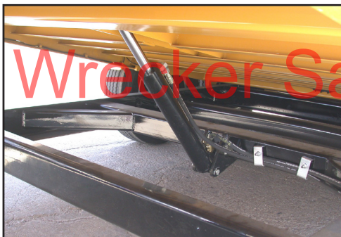
Tilt Cylinder & Frame