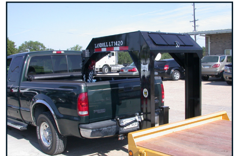
Gooseneck Connected to Hitch

Proven Solutions for Your Hauling Needs!