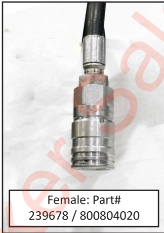
Female: Part# 239678 / 800804020